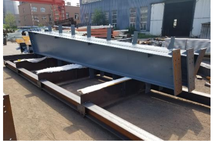
Steel Pallet for Convenient Unloading